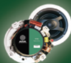
ARIA™ Multi-Room Audio