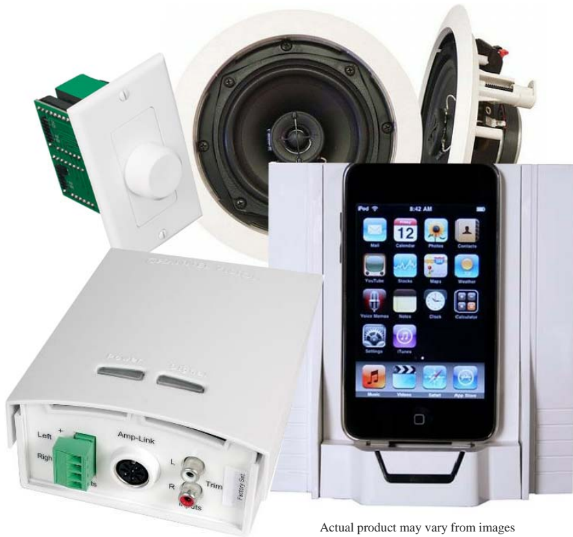
Actual product may vary from images

! Entertainers Kit IPOD AUDIO DISTRIBUTION KIT